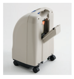
No scheduled maintenance for 3 vears

Provider maintenance is effortless and fast.