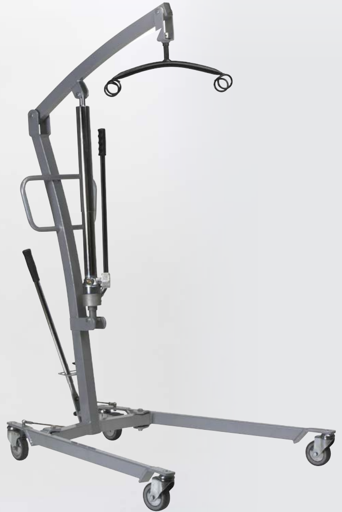
Invacare Atlante - manual version

Compact and easy to maneuver - the best choice for homecare