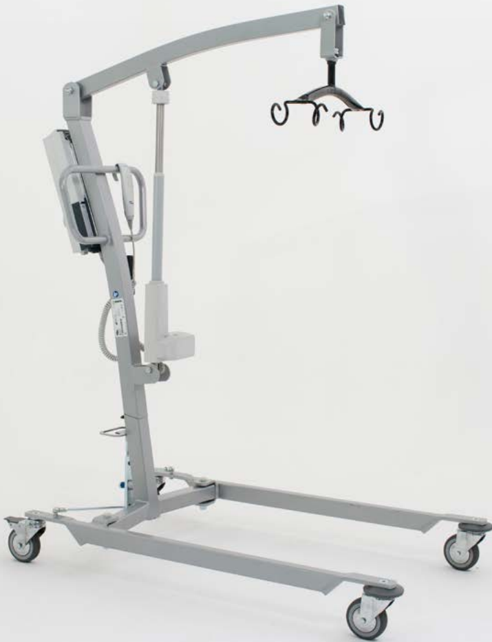
Invacare Atlante - electrical version