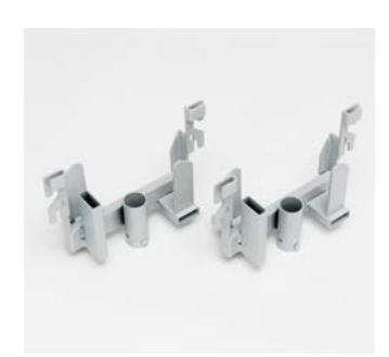
Transportation fitting for Etude Plus

Strap for locking the side rail in its lowest position. Can be used with any side rail.