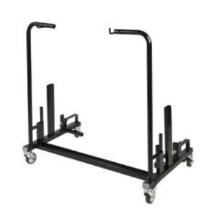
Transport trolley for Alegio NG

Trolley for easy storage and transport. Can be dismounted.