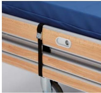
Side rail lock

Wooden adapters for mounting Octave side rail, comes in beech and cherry.