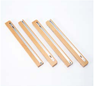
Wooden adapters -Octave bed

Extends the length of Medley Ergo by additional 15 cm.