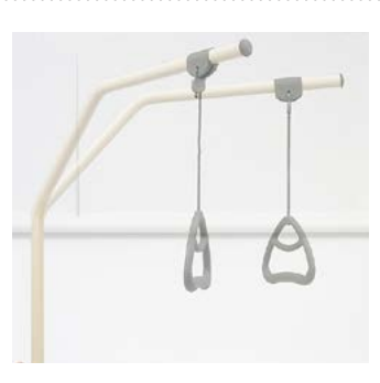
Swivel lifting pole

Catching handle can be adjusted in both height