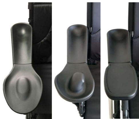
▲ (1) Flat, (2) Curved and (3) horn type right or left.

This new 360° rotative hemi armpad is ideal in combination with dual handrim propulsion. 3 different palmar supports are available for better hand positioning.