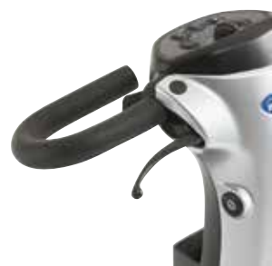
Hand brake Ensures immediate braking if required.