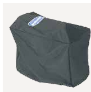
Heavy-duty storage cover Keeps the scooter clean and dry.