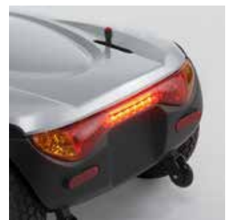
Brake light Heavy duty brake lighting warns people that the scooter is slowing down.