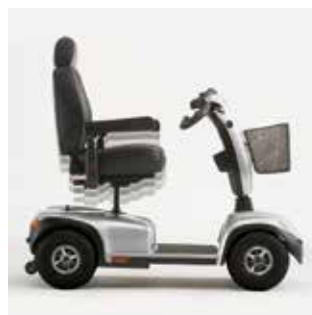
Seat raiser Electronically raises the seat to preferred height.