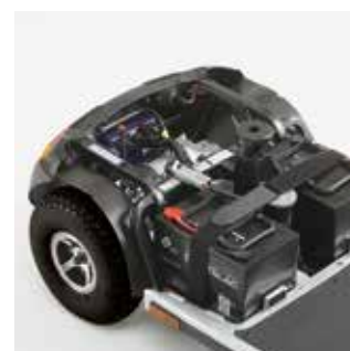
Built-in anti-splash guards Protects electronics and transaxle from dirt and water.