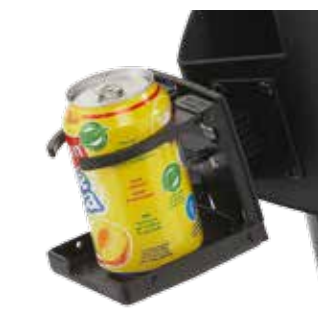
Cup holder Stores water or soft drinks.