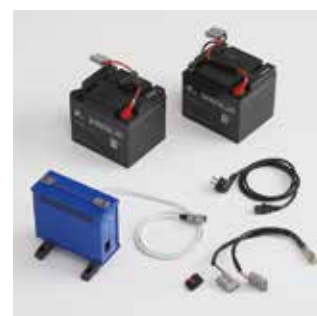
Off-board charging Simply remove batteries to charge with the off-board charger kit.