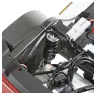
Suspension Can be adjusted at front and rear for optimal driving comfort.