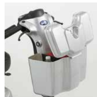
Lockable front box Secure box for personal valuables.