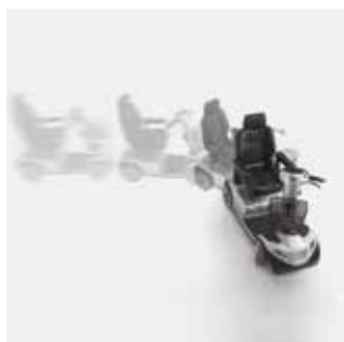
Automatic speed reduction Speed lowers during turns to ensure a safe manoeuvre.