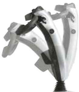
Finite tiller movement Users can easily adjust the tiller with a lever to suit their needs.