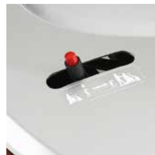
Two-step disengaging lever Prevents the scooter from accidentally free-wheeling.