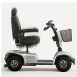
Seat suspension module For increased comfort on the move.