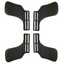
Offset Fixed Lateral Pads