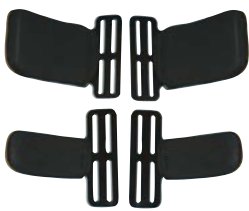
Fixed Lateral Pads