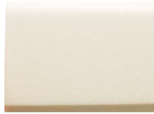
Lumbo Sacral Support