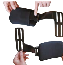
Offset Swing Away