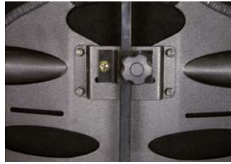
Headrest Adapter Plate