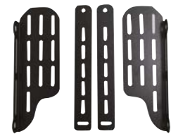
Chest Harness Interface

Cover - Oversized cover featuring SuperSoft HR foam layered over firm HR foam for comfort and protection. Attractive Meshtex cover is water resistant and breathable.