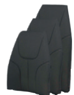
Matrix™ High Back

MODERATE Lateral trunk positioning needs