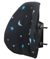
Matrix™ Mini Back

MODERATE Lateral trunk positioning needs