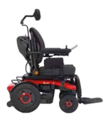
AVIVA RX 20 + One piece