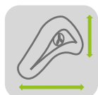
Occipital Pad ▼