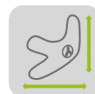
4 Point Pad ▼