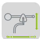
Matrix Loxx ▼

Invacare can now offer a complete rehabilitation solution: cushion, back support, belt/harness and headrest. You can explore the full range by visiting www.invacare.eu.com .