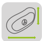
Ellipse Pad ▼