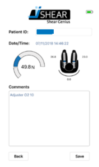
Figure 8: iShear measurement Vicair Adjuster O2