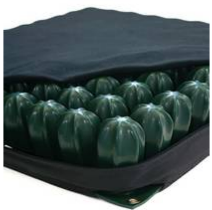
Cushion and Cover