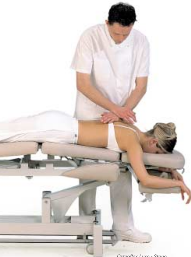
Osteoflex Luxe - Stone

The dynamic stability determines how well a treatment couch responds to changing loads, e.g. when the patient is getting on or off, when exercises are being carried out or as a result of the forces used in manipulation.